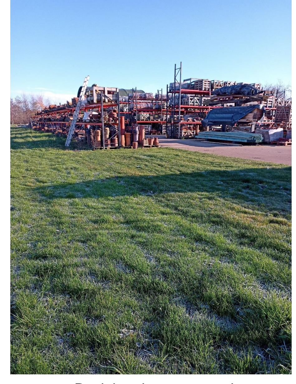
Reclaimed storage section