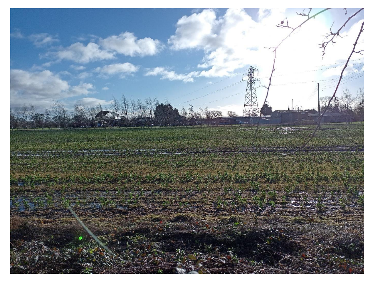
Wider view outside of the site