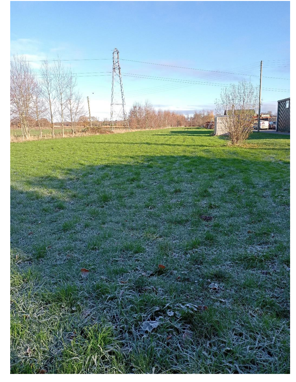
Location of proposal